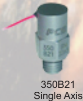
350B21 Single Axis